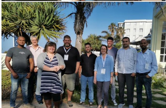
Attendees at the Specialist Course on Principles and Practice of Model Calibration and Uncertainty Analysis